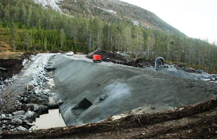
Dam and intake structure