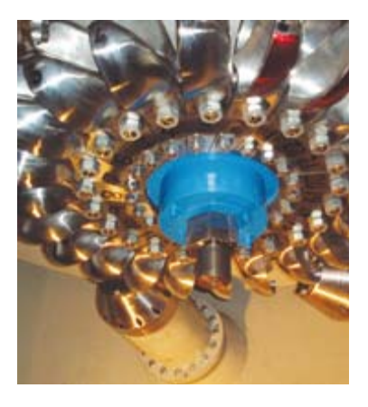
Pelton turbine with 6 nozzels